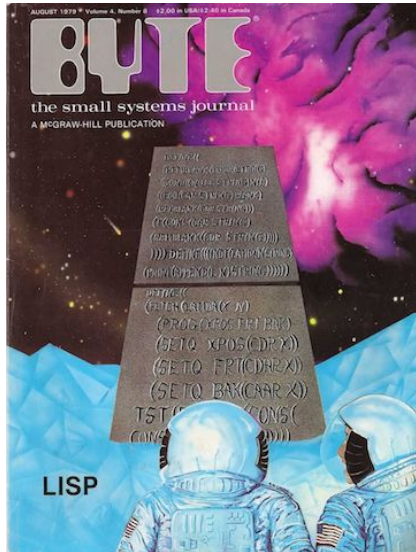
Figure 5: Byte magazine cover, August 1979, volume 4. LISP was the dominant language for artificial intelligence research through the 1990’s. LISP was particularly well suited to handling logic expressions, which were a core component of reasoning and expert systems.

turned out to be the key. Performance on ImageNet jumped with ever deeper networks in 2011 (Ciresan et al., 2011), 2012 (Krizhevsky et al., 2012) and 2015 (Szegedy et al., 2015b). A striking example of this jump in efficiency is a comparison of the now famous 2012 Google paper which used 16,000 CPU cores to classify cats (Le et al., 2012) to a paper published a mere year later that solved the same task with only two CPU cores and four GPUs (Coates et al., 2013).