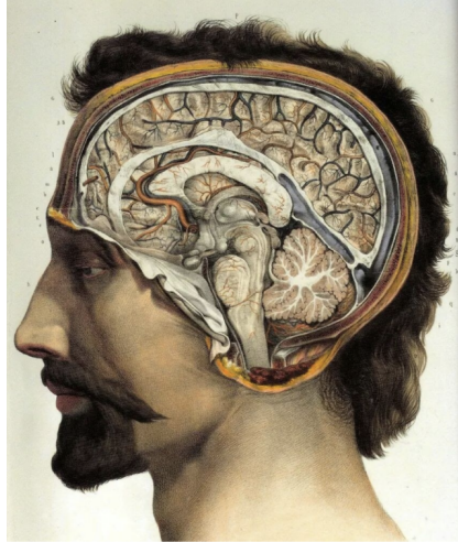
Figure 2: Our own cognitive intelligence is inextricably both hardware and algorithm. We do not inhabit multiple brains over our lifetime.

riod in computer science history that radically changed the type of hardware that was made and incentivized hardware, software and machine learning research communities to evolve in isolation.