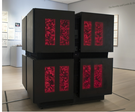
Figure 4: The connection machine was one of the few examples of hardware that deviated from general purpose cpus in the 1980s/90s. Thinking Machines ultimately went bankrupt after the initial funding from DARPA dried up.

In the late 1980/90s, the idea of specialized hardware for neural networks had passed the novelty stage (Misra & Saha, 2010; Lindsey & Lindblad, 1994; Dean, 1990). However, efforts remained fractured by lack of shared software and the cost of hardware development. Most of the attempts that were actually operationalized like the Connection Machine in 1985 (Taubes, 1995), Space in 1992 (Howe & Asanović, 1994), Ring Array Processor in 1989 (Morgan et al., 1992) and the Japanese 5th generation computer project (Morgan, 1983) were designed to favor logic programming such as PROLOG and LISP that were poorly suited to connectionist deep neural networks. Later iterations such as HipNet-1 (Kingsbury et al., 1998), and the Analog Neural Network Chip in 1991 (Sackinger et al., 1992) were promising but short lived because of the intolerable cost of iteration and the need for custom silicon. Without a consumer market, there was simply not the critical mass of end users to be financially viable.