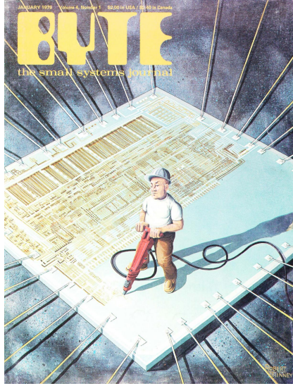
Figure 7: Byte magazine cover, March 1979, volume 4. Hardware design remains risk adverse due to the large amount of capital and time required to fabricate each new generation of hardware.