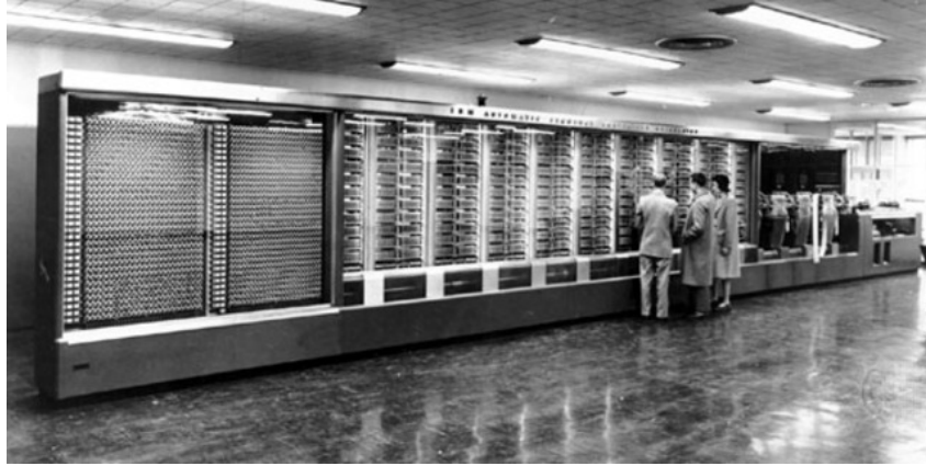
Figure 1: Early computers such as the Mark I were single use and were not expected to be re-purposed. While Mark I could be programmed to compute different calculations, it was essentially a very powerful calculator and could not run the variety of programs that we expect of our modern day machines.

breakthrough in AI may require an entirely different combination of algorithm, hardware and software.