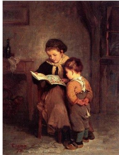
Figure 6: Human latency for certain tasks suggests we have specialized pathways for different stimuli. For example, it is easy for a human to walk and talk at the same time. However, it is far more cognitively taxing to attempt to read and talk.

In addition, our brains are able to learn efficient representations from far fewer labelled examples than deep neural networks (Zador, 2019). For typical deep learning models the